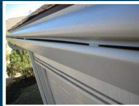
LeafGuard® $20-$24 per foot

Leaf Sentry is an aluminum, nose-forward gutter guard designed to fit securely onto your gutter and handle the heaviest of rainstorms.