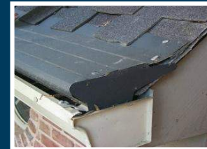
Gutter Helmet® $18-$24 per foot