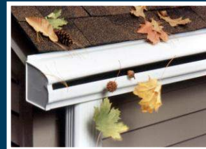
K Guard® $22-$26 per foot