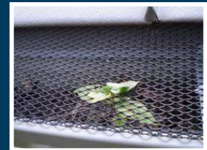
Screens $2-$4 per foot